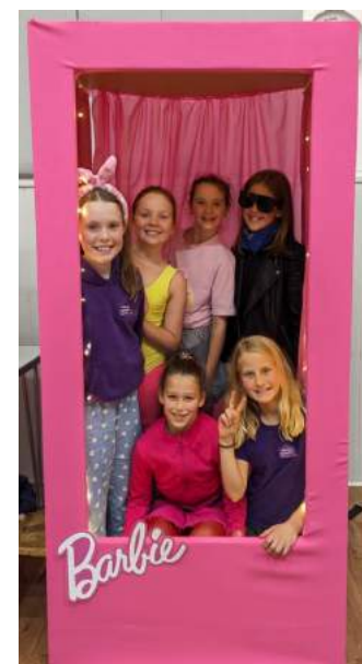
Bass Rocketeers Netball Barbies