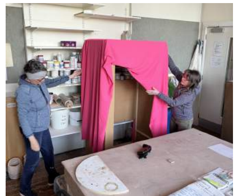
Getting the Barbie box ready