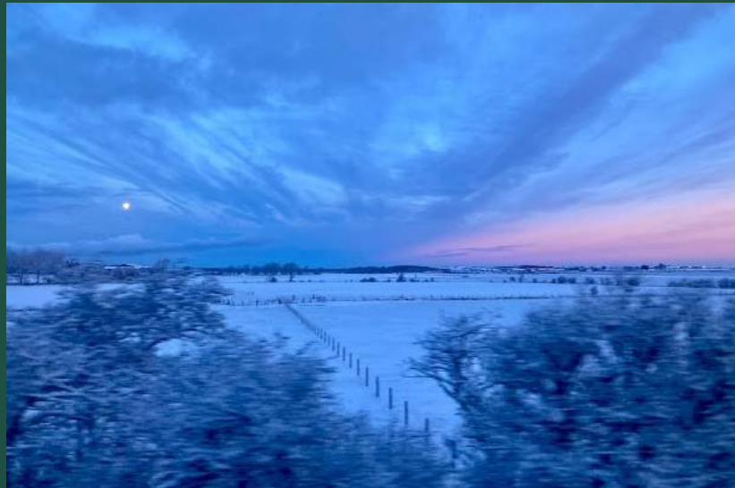
'Winter scene taken from a train speeding away from North Berwick' - Ruth