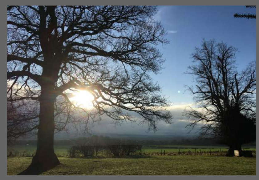
'Beautiful trees at Beanston Farm' - Ruth Fraser