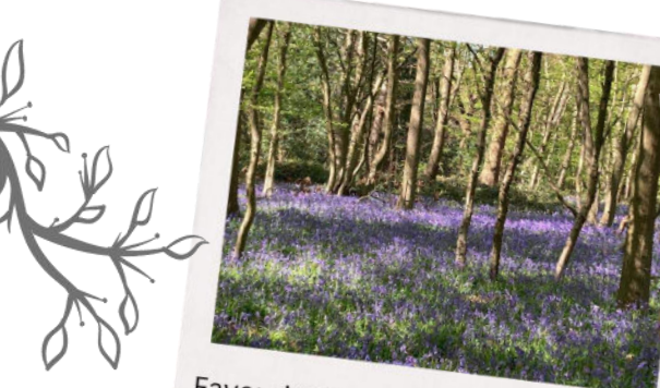
Favourite woody walk near old home in Essex, 'Holybred Wood' - Alison