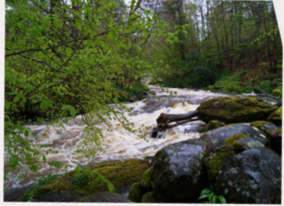
Oh The Hermitage for me too and the beautiful Birks o' Aberfeldy! - Ann