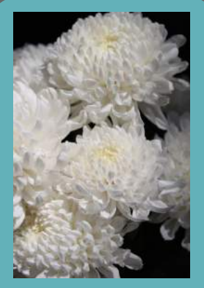
To our members and volunteers having a birthday this month, we wish you a very