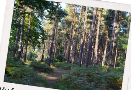
My favourite woods - the Anagach, Grantown On Spey, I enjoy walks all the way through river Spey. - Ellen